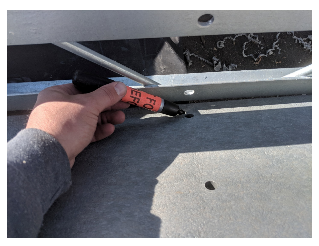
Step 7 continued